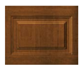
Classic Medium Finish