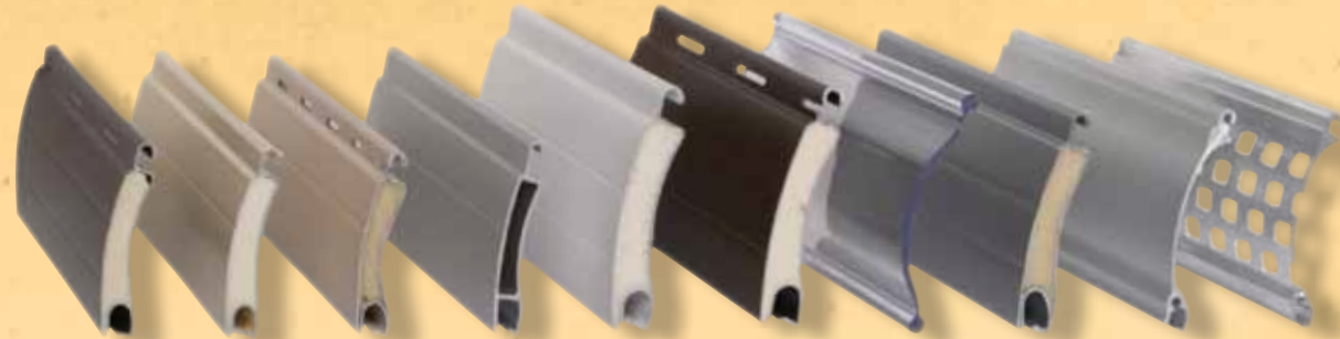
400 Series 420 Series 440 Series 450 Series 500 Series 520 Series 530 Series 540 Series 560 Series 561 Series