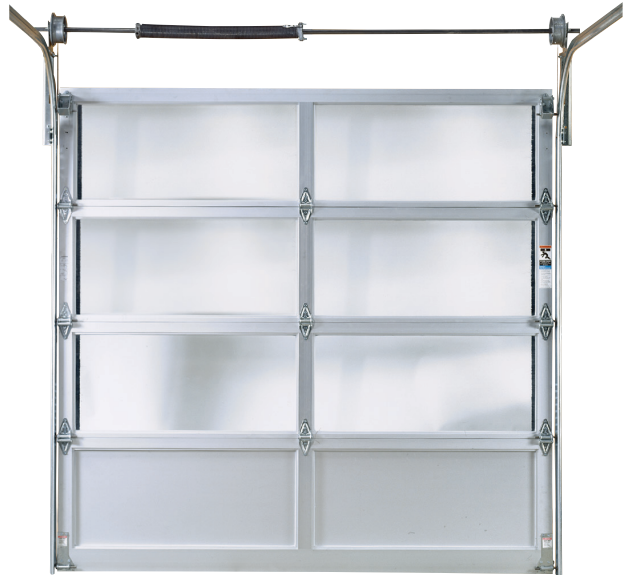
AlumaView AV200 with aluminum bottom panels.

AlumaView doors help you reduce energy costs with a U-shaped, vinyl bottom weatherseal secured by a sturdy aluminum retainer.