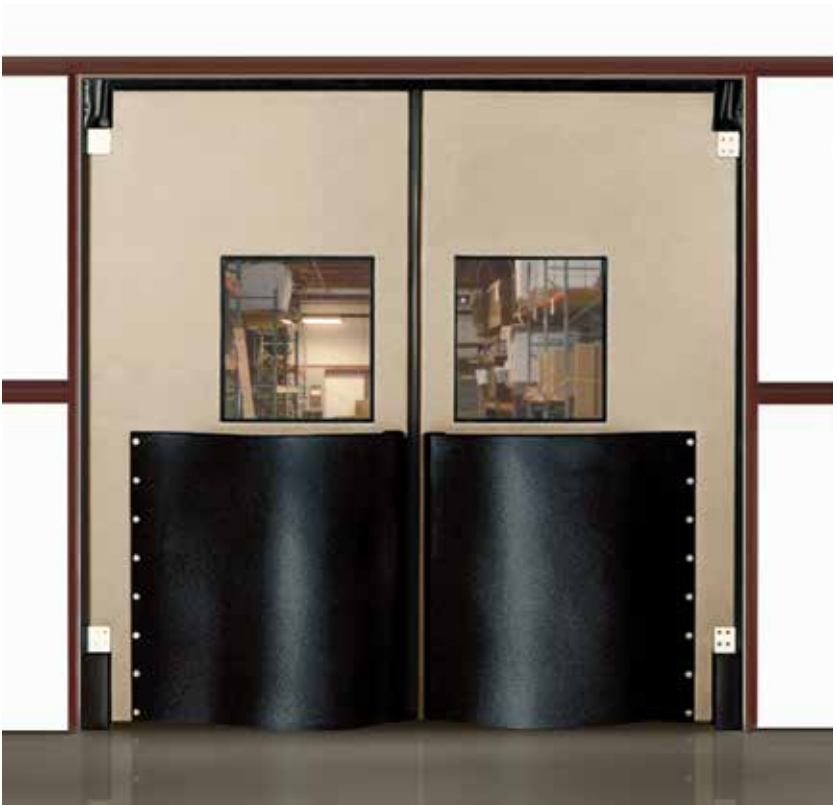
FX-9000 shown in warehouse / industrial setting.

TRAFFIC: Pedestrian, Push Cart, Pallet Jack APPLICATIONS: Kitchen & Restaurant, Retail & Supermarket DOOR BODY: 1/4" thick ABS material reinforced with 2 pieces of 1/4" x 7" ABS along the jamb side, creating a back spline with a total thickness of 3/4" (capped with stainless steel back channel), textured surface (front side only) WINDOW: 14" x 16" clear acrylic set in black rubber molding HINGE: Eliason Easy Swing® Hinge AVAILABLE OPTIONS: ABS Impact Plates, ADA Compliant Windows, Lower Hinge Guards