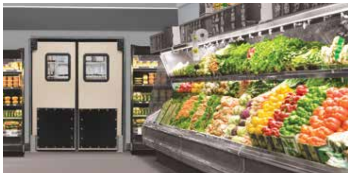
SUPERMARKETS / GROCERY STORES