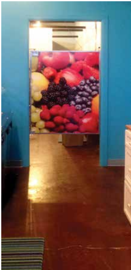
SCP Gate / Cafe shown with graphic door option.

TRAFFIC: Pedestrian APPLICATIONS: Kitchen & Restaurant, Retail & Supermarket DOOR BODY: .063" thick tempered aluminum alloy, shown above with optional high-pressure laminate. HINGE: Eliason Easy Swing® Hinge AVAILABLE OPTIONS: Contour top, .032" decorative high-pressure laminate (both sides). Wide selection of stock laminates available. Custom laminates can be specified.