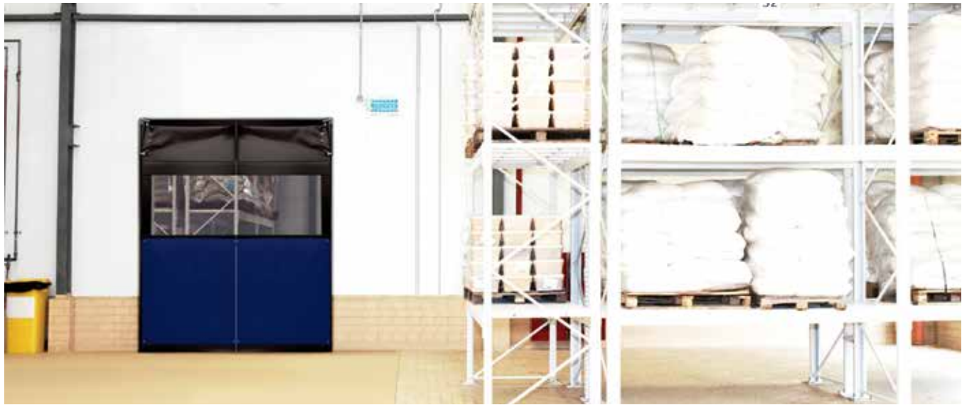
Chase Doors AirGard 973 shown in stock room application.

Whether it's a traffic door, air barrier, roll-up door, fiberglass door or entry way door, Senneca Holdings has your entire supermarket application covered when it comes to door openings. Keep bugs and debris out by installing an Enershield Air Barrier above your secondary entry doors. Install double acting traffic doors to allow for ease-of-access for your employees. Durashield roll-up doors are perfect for allowing sunlight and ventilation into your back dock area, while deterring insects and debris. Still have questions? Please contact your local sales representative or call us at 800.543.4455.