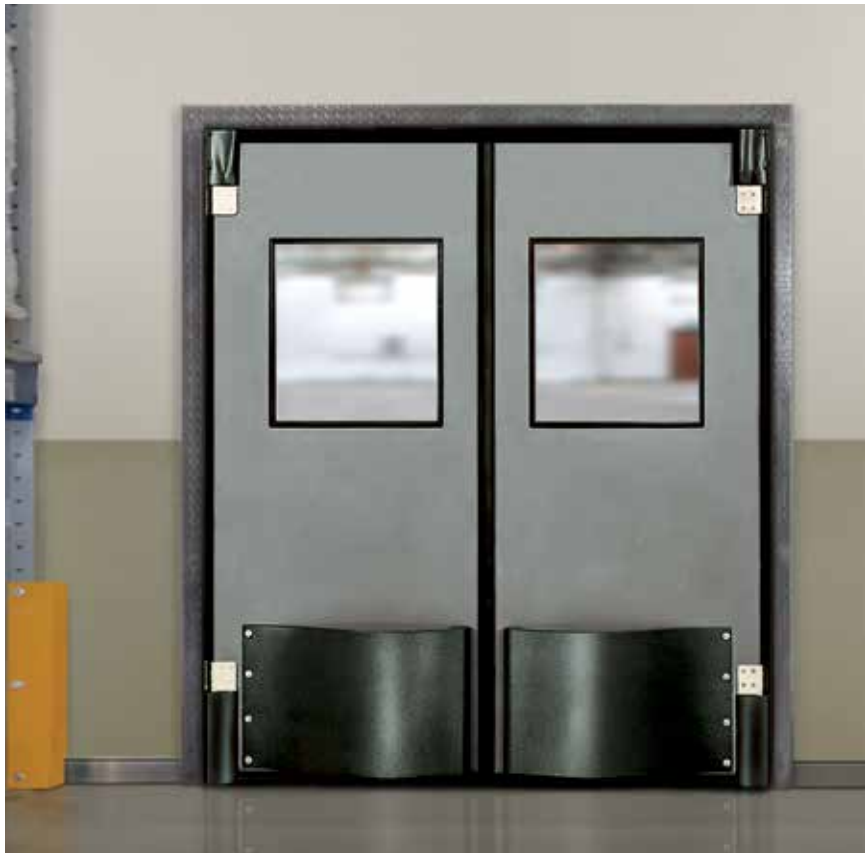
Chase Doors SR-9000 Traffic Door shown in stockroom to sales application.

TRAFFIC: Pedestrian, Push Cart, Pallet Jack, Forklift APPLICATIONS: Retail & Supermarket, Industrial & Commercial, Cooler, Freezer, Washdown DOOR BODY: 1-7/8" Overall thickness, 1/4" thick rotationally molded polyethylene skin retains properties to -40°F, leading & back edge internal reinforcement & gasket WINDOW: 1/8" polycarbonate, black frame, HINGE: V-Cam Hinge System AVAILABLE OPTIONS: 180° x 90° Hardware, Teardrop Bumpers, Impact / Kick Plates, Lower Hinge Guards, Spring Assist, Locking Devices, Window Options