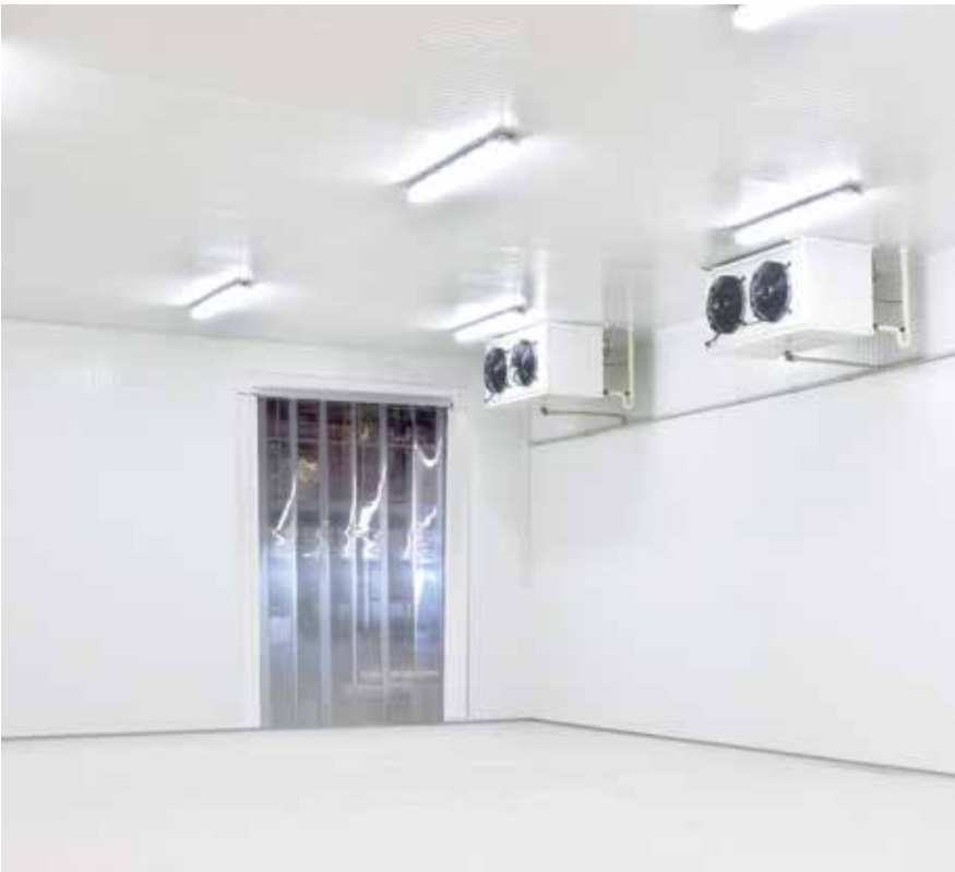
Strip Door shown as secondary door in a walk-in cooler/freezer application.

TRAFFIC: Pedestrian, Push Cart, Pallet Jack, Forklift APPLICATIONS: Retail & Supermarket, Restaurant, Food Processing, Institutional CONSTRUCTION: Compact, low-profile, available in 3,4 and 6 Feet lengths. Standard 110v plug-in units with 2 speed settings. Standard model includes remote and magnetic reed switch for Automatic Activation. OTHER: CSA Listed in Canada and UL Listed in US and Canada. AVAILABLE OPTIONS: Color Options Available