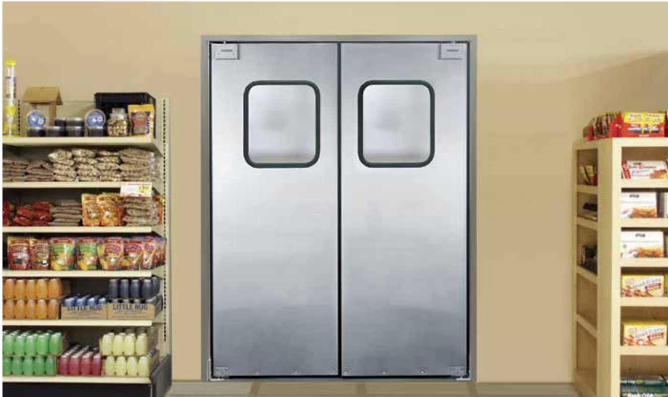
Eliason FCG Series shown in a supermarket application.

TRAFFIC: Pedestrian, Push Cart, Pallet Jack APPLICATIONS: Kitchen & Restaurant, Retail & Supermarket, Industrial & Commercial, Cooler & Freezer DOOR BODY: 1/8" thick high-density rotationally molded polyethylene and Non-CFC urethane foam core. Replaceable perimeter edge gasketing, full height backspine. HINGE: V-Cam Hinge System AVAILABLE OPTIONS: Window Options, Impact / Kick Plates, Teardrop Bumpers, Cart Guards, Locking Devices, 180° x 90° Hardware, SlideTrac Bumpers™