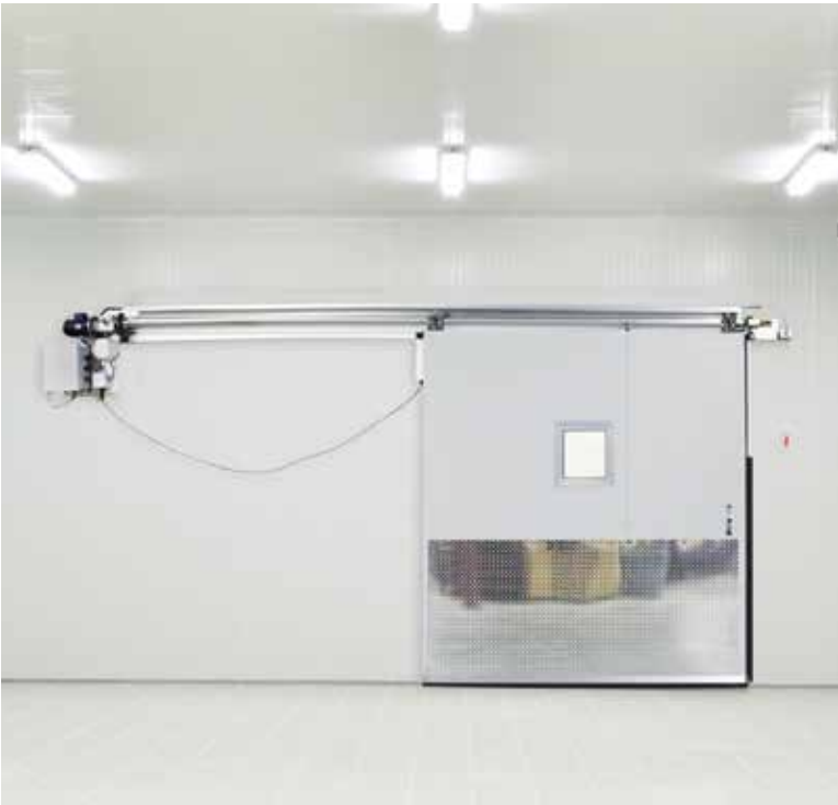
Chase ColdGuard Sliding Cold Storage Door shown in Freezer room application.

TRAFFIC: Pedestrian APPLICATIONS: Retail & Supermarket, Cooler, Freezer DOOR BODY: Aluminum door frame, reversible door swing, automatic hold-open, electrical hinge pin, torque and sag adjust, magnetic door gaskets, standard 27" deep shelving. OTHER: EISA Compliant AVAILABLE OPTIONS: 2 or 3 Pane Heated / Non-Heated Glass, Energy-Free Cooler Door, French Door Frame (cooler only), Pass-Thru Door Version, Prostar LED