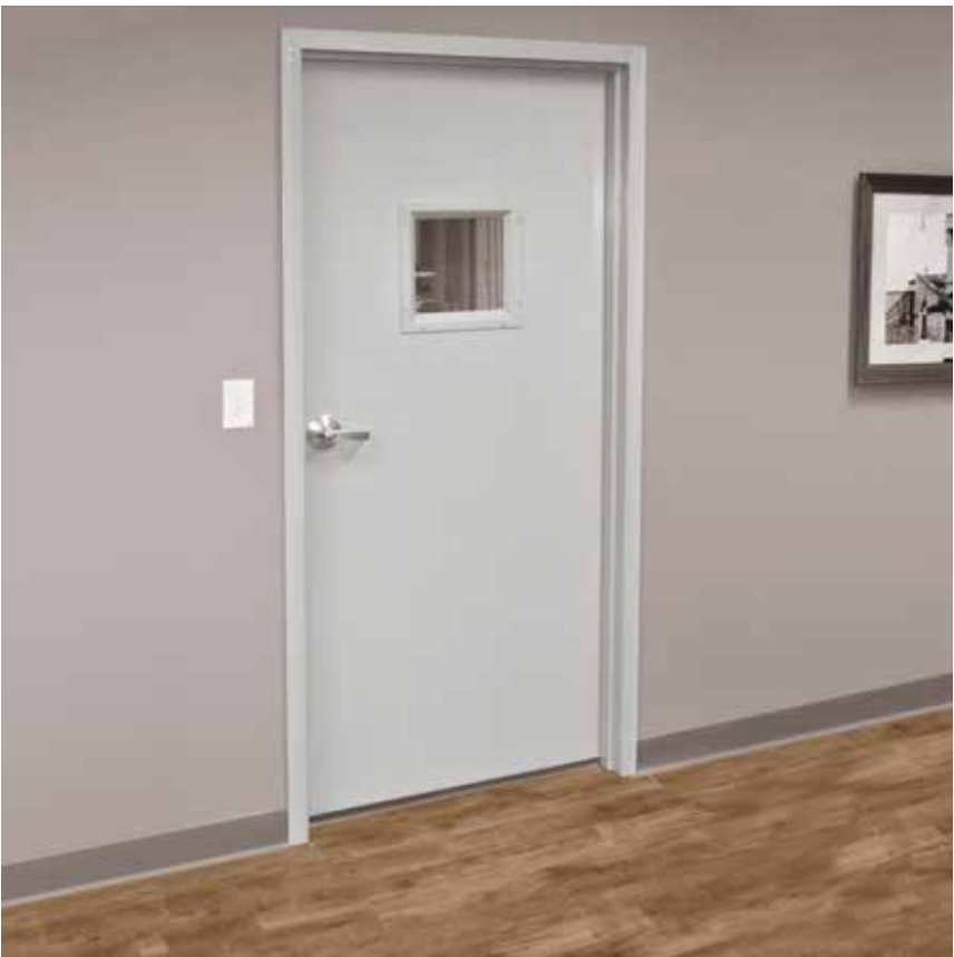
Fib-R-Lite Fiberglass Door shown in interior corridor application.

TRAFFIC: Pedestrian APPLICATIONS: Restaurant, Retail & Supermarket, Pharmaceutical, Food Processing, Industrial, Clean Room, Corrosive DOOR BODY: In-Mold 25-30 mil gel coat and muscular bi-axial glass fiber structural reinforcement layer. Phenolic Resin Impregnated Honeycomb core is standard. AVAILABLE OPTIONS: Window Options, Lite Kit Options, Polypropylene Honeycomb Core, Gypsum Mineral Core, Polyisocyanurate Foam Core, Thresholds, Door Sweeps, Door Louvers, Weatherstrips and Gaskets, Astragals, Frame Options