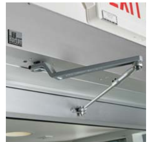
Surface Applied Operator